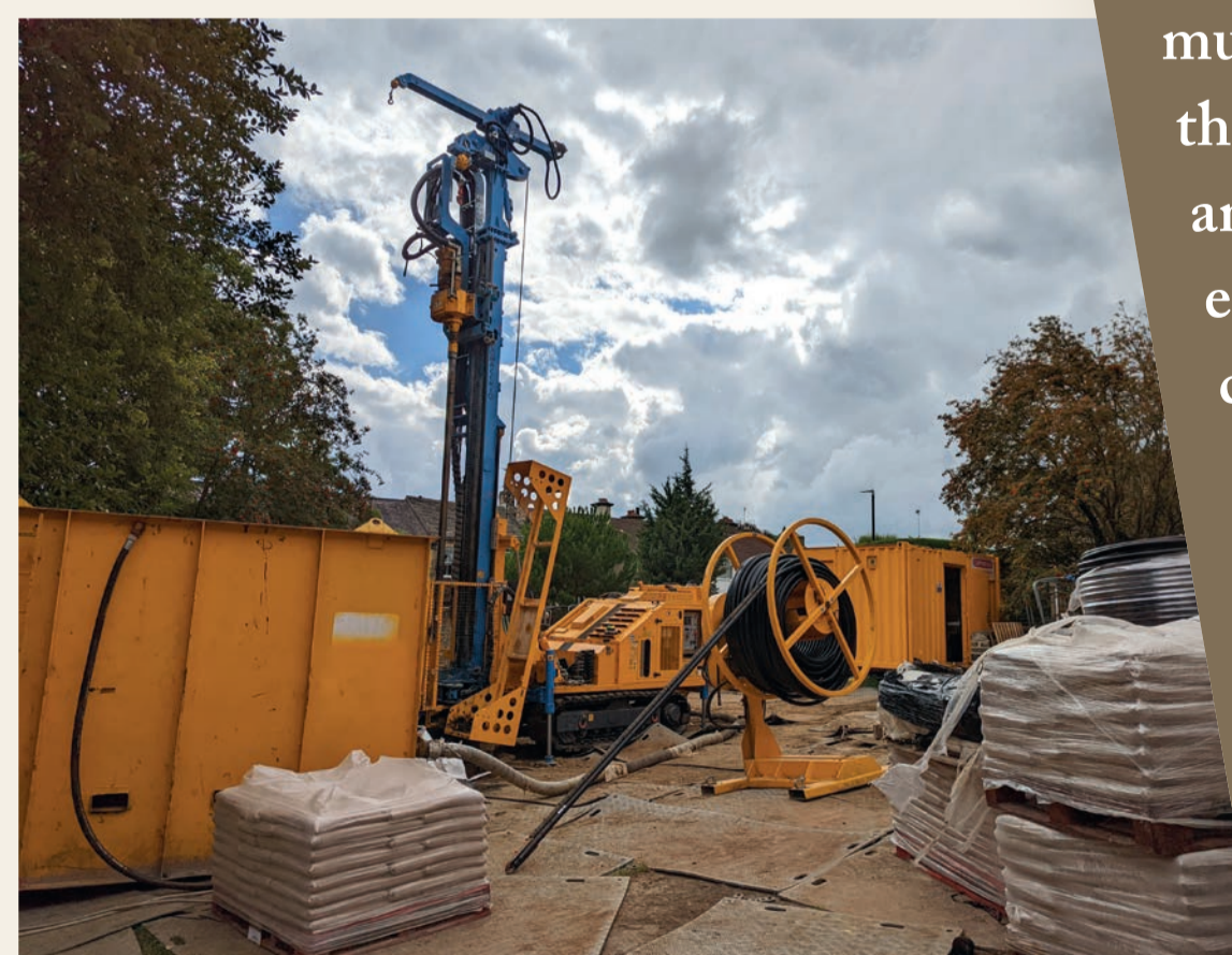
Drilling the 143 metres-deep boreholes for the ground source heating system.

The landscaping and furnishing were completed, and guests were able to stay in the building for the first time.